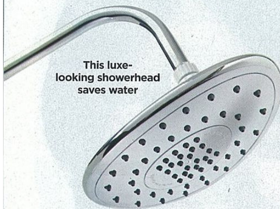
This luxe-looking showerhead saves water

$5.99 U.S. $6.99 Canada Shapebride.com Display until May 16, 2010