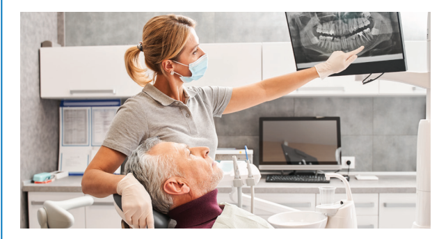
Clinical examination of implants, teeth and all structures of the mouth